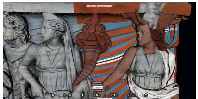
Fig. 9. Visualization of an hypothesis of 3D polychrome reconstruction by directly clicking on the palette colours icon.