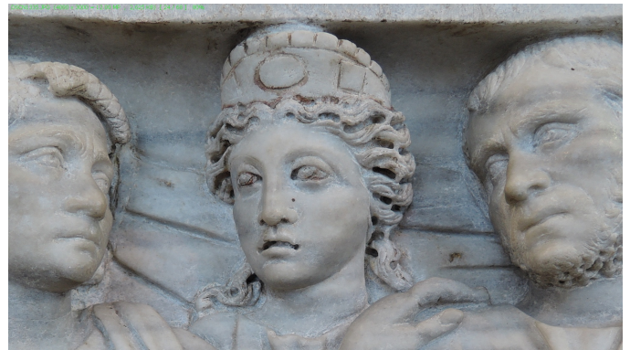
Fig. 11. Polychrome detail of the Concordia personification.

This new investigation has also identified some traces of blue and white colours that seem unpublished until now in the academic literature [20], [19]. The blue areas are visible with the naked eye in a hidden area of the parapètasma near Africa and under the node of the parapètasma near the Annona 's shoulder (Fig. 3). The blue pigment is applied directly on the marble surface probably with broad brushstrokes [5], [28]. In addition, the VIL imaging shows Egyptian blue (invisible to the naked eye) also on the thymiaterion , on the sea waves, on the horn of plenty and on the Annona and Abundantia 's interior tunic. A uniform distribution of small Egyptian blue granules are also revealed in the white ornamental edge of