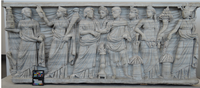
Fig. 2. The so-called ‘Annona sarcophagus’, Museo Nazionale Romano – Palazzo Massimo (inv. no. 40799).

In the following sections, for each step, we describe only the main activities performed on the Annona sarcophagus.