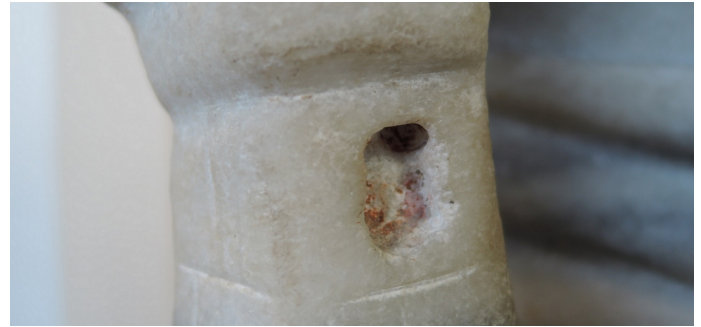
Fig. 13. Polychrome traces in the lighthouse areas of the Portus' attribute.

ground layer. That can be attributed either an ancient re-painting or restoration, or most likely at the simultaneous use of two different techniques in applying the colour. Moreover, the Annona sarcophagus is characterized by the rendering of the completely polychrome figurative elements, similarly to the investigated sarcophagus with Dionysus and Ariadne (MNR-TD, inv. no. 124682) [5], [28], and the so-called 'Casali sarcophagus' (Ny Carlsberg Glyptotek, inv. no. 843) [35].