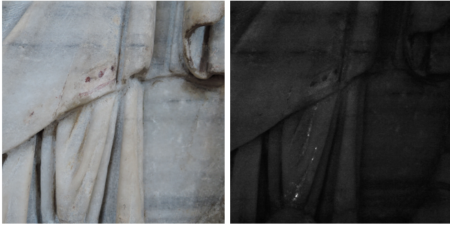
Fig. 12. Polychrome detail of the ornamental edge of the Annona's palla (left) and the same area in VIL imaging that shows the distribution of glowing white particles of Egyptian blue (right). On the white band the EB is located as scattered particles, while on the stola a compact layer is observed.

The inferior ornamental edge of the Africa's palla preserves traces of a solid dark red line, approx. 0,5 cm wide. This colour corresponds to the presence of haematite pigment, which appears directly applied on the marble surfaces. A very small trace of this colour was also recently detected on the inferior ornamental of the bride's palla [5], [29].