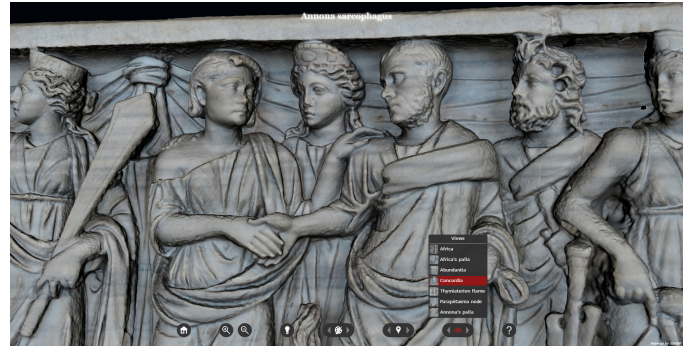
Fig. 6. 3DHOP supports the definition and visualization of a predefined set of views, selected to show the most representative polychrome areas on the Annona sarcophagus.

The archival and literature searches, performed in the historical library and in the Museo Nazionale Romano catalogue, revealed that the Annona sarcophagus was discovered in via Latina, Rome some years before 1877. It was found with its fragmented lid in a modest tomb [20] together with the sarcophagus with Cupids holding clypeus and garlands, dedicated to Flavius Valerius Theopompus Romanus (Museo Nazionale Romano – Terme di Diocleziano, inv. no. 514). The sarcophagus was described with a lot of polychromy (red