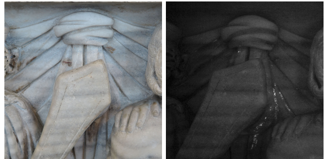
Fig. 3. Polychrome detail of the parapètasma (left) and the same area in VIL imaging that shows the distribution of glowing white particles of Egyptian blue (right).

The VIL and UVL images was acquired with a Canon 350EOS camera without IR-blocking filter. The camera operates in manual mode. For the VIL analysis we use a LED light (1100 lumen) without IR radiation and a longpass IR filter Schott RG830 in front of the camera lens. For the UVL we use a UV LED light and a combination of a bandpass visible filter (Schneider – Kreuznach UV-IR-CUT) and a longpass filter Schott KV418 for the camera lens. The photos were acquired using a small portable dark room to remove all possible environment lighting.