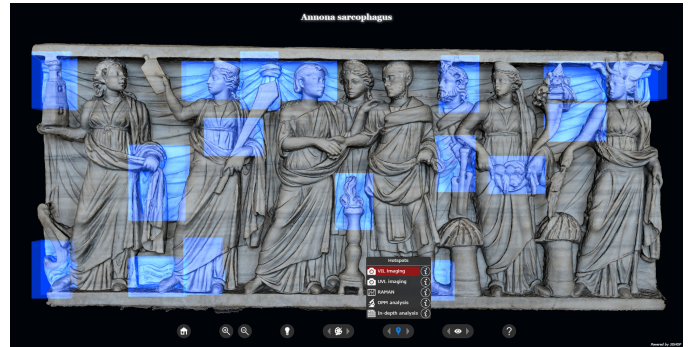
Fig. 7. Visualization of the selected areas where the VIL analysis were performed.