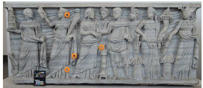
Fig. 4. Micro-samplings position of colours and golden traces on the Annona sarcophagus (MNR-PM, inv. no. 40799).

Among the examined sarcophagi, the Annona sarcophagus shows some peculiar properties about the technique used for colour and gilding application. For this reason four micro-samples (Fig. 4) have been taken respecting the minimal invasive standards.