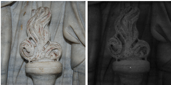
Fig. 10. Thymiaterion flame polychrome detail (left) and the same area in VIL imaging that shows the distribution of glowing white particles of Egyptian blue (right). On the flame the EB is located as scattered particles, while on the shaft shows a enough compact layer.

colour) and gilding [20] traces, which were largely vanished in 1983 [19]. Direct inspection shows a great amount of dark red, red like cyclamen, and gilding. Specifically, red tending towards cyclamen (or bright pink) was applied to the thymiaterion flame (Fig. 10, at left) with wide background paintings or, more probably, with large brushstrokes. This red pigment was possibly superimposed to the thin white layer, or, even more plausibly, it was applied as a mixture with white, pink and blue to create a lighter shade or a nuance effect. Indeed, OPM and Raman spectroscopy results highlighted that the white substance, characterized by low refractive index and birefringence, is attributable to the gypsum, while the red tending towards cyclamen is made of haematite granules [5], [28]. VIL imaging reveals a few number of small Egyptian blue particles (Fig. 10, at right), while visual inspection through portable microscope allow us to also identify many traces of presumably rose madder lake vegetable dye (UVL analysis is planned on May 2015).